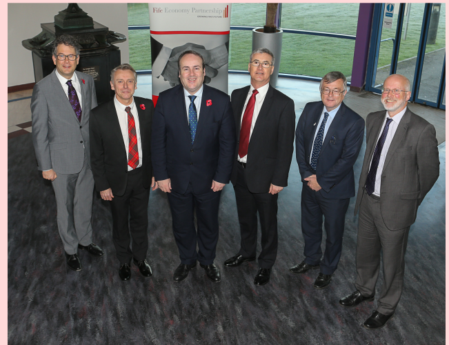
Members of the Fife Economy Partnership meet Paul Wheelhouse MSP, Minister for Business, Innovation & Energy

Its roles, which are overseen by the Executive Group, include setting the priorities for growing Fife’s economy, overseeing the implementation of Fife’s Economic Strategy 2017-2027 , ensuring the public sector’s policies and activities support the growth of the Fife economy, and presenting Fife’s case to the Scottish Government and Scottish Enterprise.